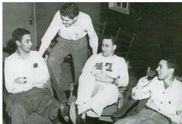
Above: Brothers of Chi Alpha (the local fraternity that was the predecessor of Alpha Sigma Phi at BGSU) relaxing in the upper floor of Ivy Hall - their home in 1950.