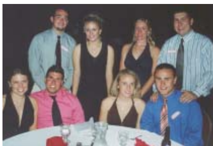
Members of the current undergraduate chapter enjoy the Saturday evening banquet with their dates at the Elks.

undergrad/alumni flag football game in the oval behind the chapter house. Sorry, but as of press date, we haven't heard who won this year! Plans are already underway for next year and we hope to see all of you there! If you have any questions or need help making arrangements for the Homecoming weekend, do not hesitate to contact a member of the council.