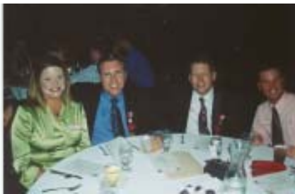
Alumni enjoy the banquet at the Elks Lodge on Saturday evening.

Homecoming 2005 has come and gone, and we were happy to see the many alumni who came back to join in the celebration with the members of the undergraduate chapter.